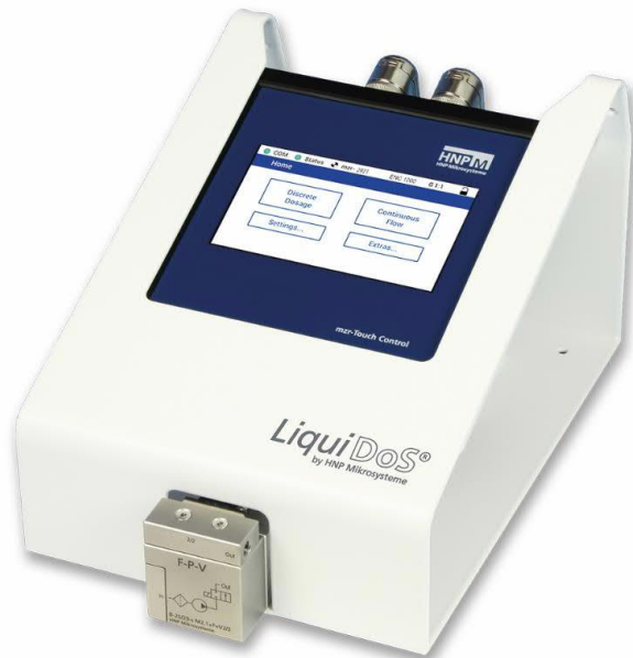
Versatile dosing system LiquiDoS Picture: hnpm_LiquiDoS_EN_freige.jpg